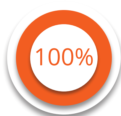
Board of Directors participation in giving to campaign